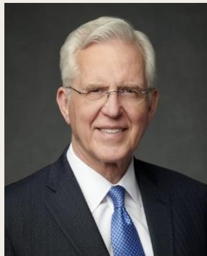
D. Todd Christofferson Quorum of the Twelve Apostles

All elements of society, "including ourselves, have gained greater understanding, especially in recent years as we've seen more intercommunication, more sharing back and forth, more openness on all sides [on the] social and physical science issues and all the other pieces to the puzzle." The issue is now "coming into focus, but there are still a lot of questions we are seeking added understanding." "We are still learning."